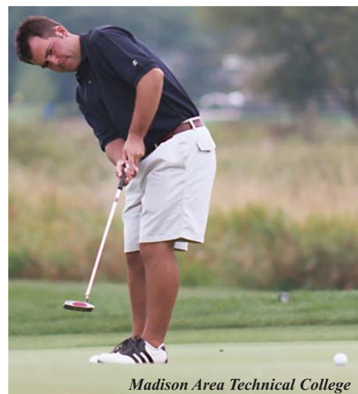
Madison Area Technical College