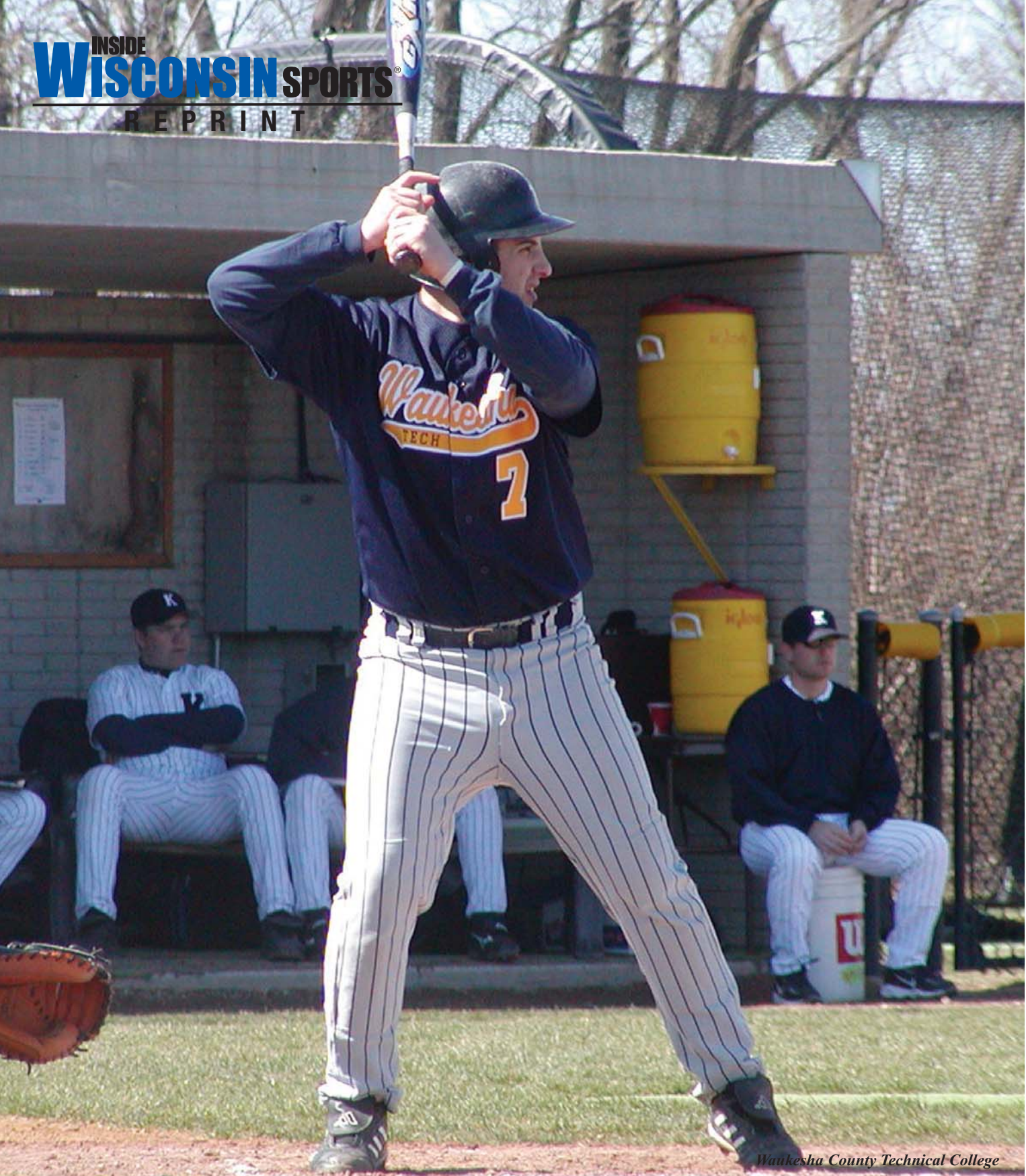
Waukesha County Technical College