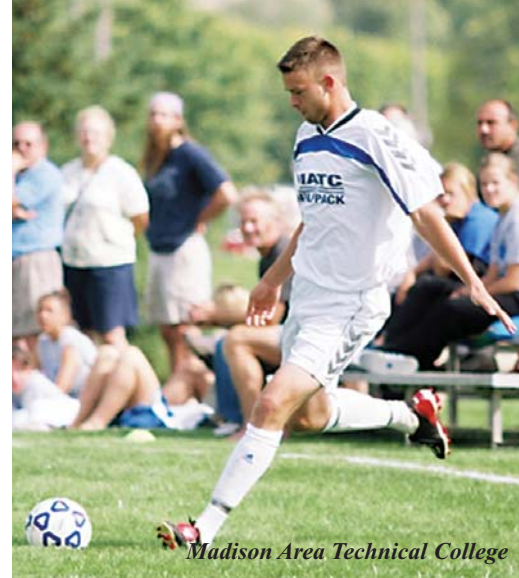
Madison Area Technical College